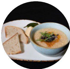
Chicken Soup - £6.95 Served with sourdough bread.