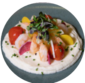
Prawns with Cauliflower Puree - £13.95 Fennel and orange salad prawn, roasted cherry tomato, cauliflower puree, micro greens.