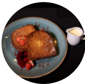
Homemade French Brioche Toast with stuffed Strawberries (V) - £9.95 Mascarpone, cream, strawberry puree, decorated with Strawberries.

All food is prepared in a kitchen where cross contamination may occur and our menu descriptions do not include all ingredients. Full allergen information is available upon request.