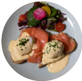
Eggs Royale - £12.95 Smoked Salmon, poached eggs, hollandaise sauce and sourdough bread, chives.