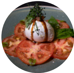
Buffalo Mozzarella with Tomatoes (V, GF) - £12.95 Basil, balsamic glaze, olive oil, salt, pepper.