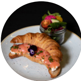
Baked Croissant with Smoked Salmon and Cream Cheese - £10.95