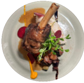
Lamb Shank - £24.95 Savour the succulence of lamb shank seasoned with middle eastern spices. Served along side roasted vegetables and mashed potato. All crowned with a decadent demi-glaze. With a decadent demi-glaze.