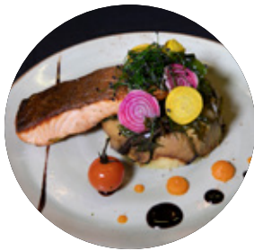
Pan Roasted Salmon (GF) - £19.95 Pan seared salmon, Moroccan cous cous, aubergine, courgette, chickpeas.