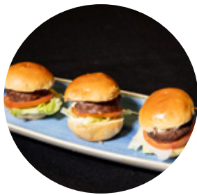
Angus Beef Sliders - £12.95 Angus beef, mini brioche bun, tartare sauce, baby gem lettuce, cheddar cheese.