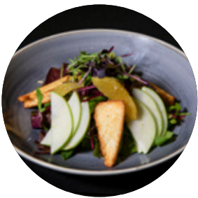
Halloumi and Baby Gem Salad (V, GF) - £9.95 Halloumi cheese, green apple, mixed toasted seeds, micro greens.