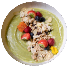
Avocado Smoothie Bowl (V, VE, GF) - £9.95 Avocado, baby spinach, banana, decorated with forest fruit, granola, almonds.

We hope you share our love of Mediterranean and Middle Eastern dining, and enjoy the KOUKASH experience as much as we enjoyed creating it.