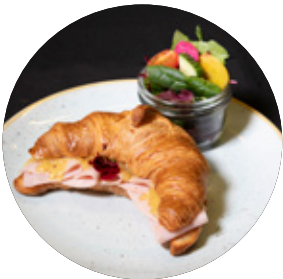
Baked Croissant with Cheddar Cheese and Ham - £9.95