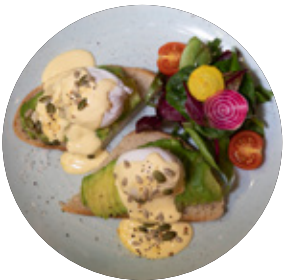
Avocado Benedict (V) - £12.95 Avocado, poached eggs, hollandaise sauce and sourdough bread, chives.