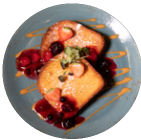
Homemade French Brioche Toast with Salted Caramel (V) - £9.95 Salted caramel, mixed berry jam.