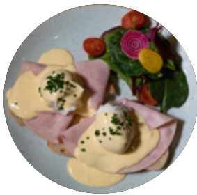
Eggs Benedict - £9.95 Ham, poached eggs, hollandaise sauce and sourdough bread, chives.